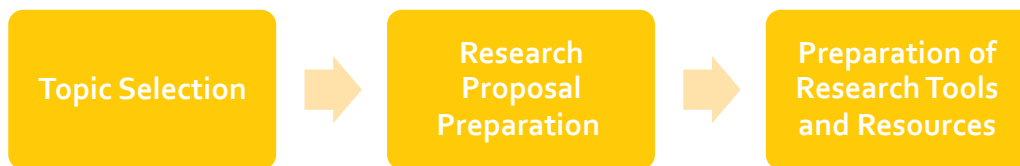
Figure 2: The inner steps of the "Preparation and Planning" stage

This stage aims to determine the basics on which the research will be built, including selecting the research problem, preparing the research plan, and the necessary resources and tools. Proper planning at this stage is crucial to ensure that the research is conducted in an organized and effective manner. Figure 2 shows the inner processes within this stage.