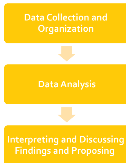
Figure 3: The inner steps of the "Implementation" stage

After making the resources and research tools available and preparing the work environment, the researcher begins to carry out the research, and this stage occupies most of the time allocated to the research. The details of implementation vary according to the research methodology. However, it can be said that research commonly includes the following basic stages: